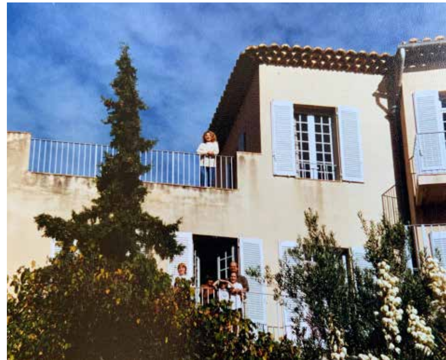
FORMER FELLOWS WITH THEIR FAMILY IN 1996

Animals other than officially registered service animals are not allowed. Fellows are responsible for securing all necessary documents and meeting all standards if bringing a service dog from outside of the country.