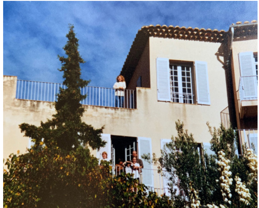
FORMER FELLOWS WITH THEIR FAMILY IN 1996

Animals other than officially registered service animals are not allowed. Fellows are responsible for securing all necessary documents and meeting all standards if bringing a service dog from outside of the country.