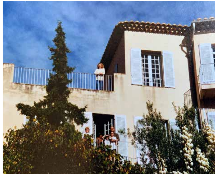
FORMER FELLOWS WITH THEIR FAMILY IN 1996

Animals other than officially registered service animals are not allowed. Fellows are responsible for securing all necessary documents and meeting all standards if bringing a service dog from outside of the country.